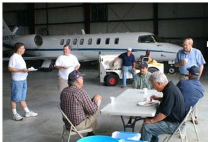
A good breakfast on a cloudy day

Our next breakfast is June 20 . The weather forecast is a long way away so there's no telling how it will be that morning. Everybody who comes has a good time no matter what the weather is so make sure you mark this on your calendar and come out to the airport.