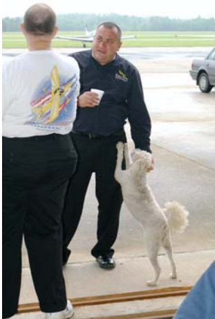
Maybe if I beg harder.