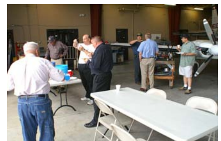
Everybody enjoying themselves

This newsletter needs your input! Email your ideas, comments, and suggestions to eea1350@eea1350.com .